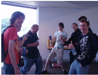
LEFT: Sydney's pizza lunch RIGHT: Canberra's BBQ.

Throughout February each AIE campus held a lunch time event to welcome the new students of 2009. Canberra held a lunch time BBQ while Sydney & Melbourne celebrated with pizza and game play! A lot of fun was had by all staff & students at each campus.