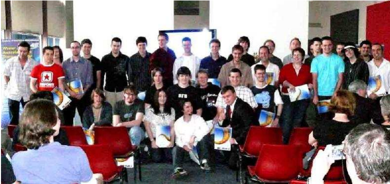
Above: The Advanced Diploma of Professional Game Development class of 2008.